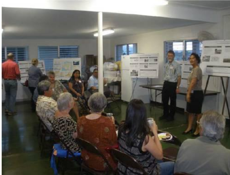
Public Outreach with the Community

A Publication of the Hawaii Chapter of the American Planning Association