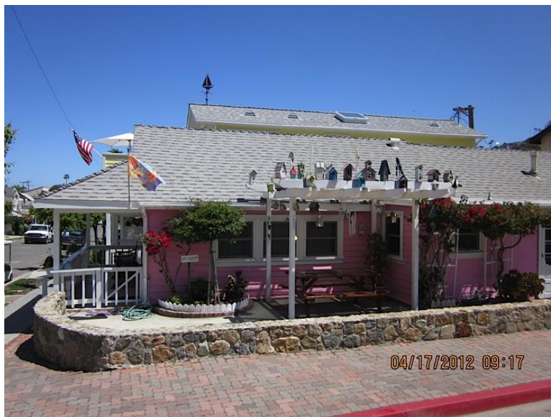
Mixed-Use Birdhouse Neighborhood

Median income is about $46,000. Median cost for a small house (2BR, 1B) is about $5-600,000. Due to limited land area, typical lot sizes are 25' x 40' and are able to sustain only a modest cottage. Due to this severe shortage of housing, some employers have actually bought homes to house their employees, as this is the only way to attract the needed workforce to support the tourist economy.