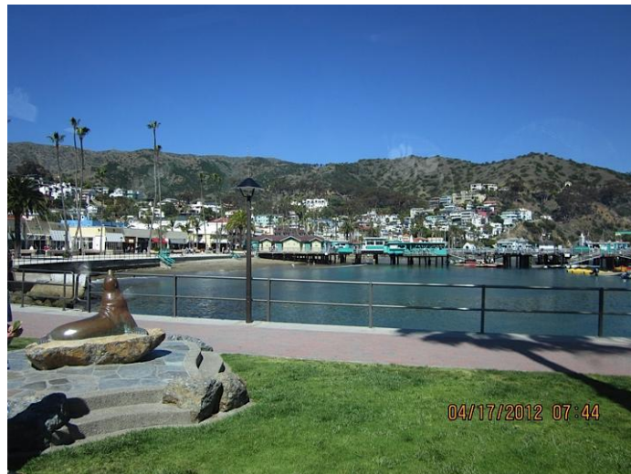
View of Avalon from Waterfront Park