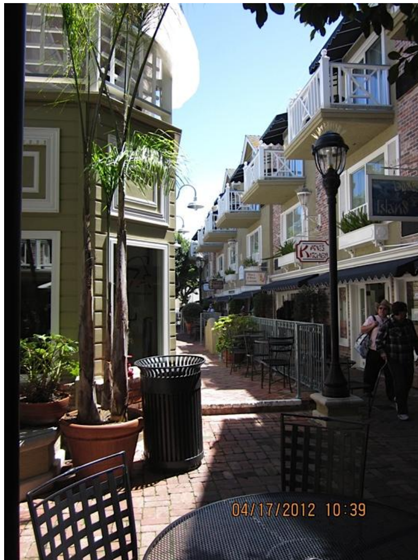
Pedestrian Way in Avalon

The island's most notable landmark is the Casino, which was built in 1929. It has never permitted gambling and derives its name from the Italian language and means the gathering place. Over the years it has functioned as a grand ballroom for many affairs. It presently functions as a museum with several galleries and a gift shop. The visit was truly a glimpse of a unique place which is rich in history and natural resources and which has attractions for many. It is also unique in the sense of its planning problems because of its isolated location.