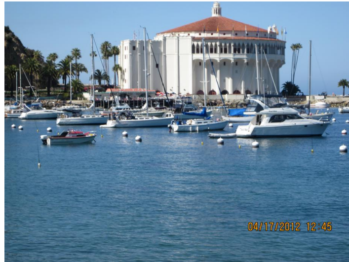
The Iconic Casino in Avalon

A Publication of the Hawaii Chapter of the American Planning Association