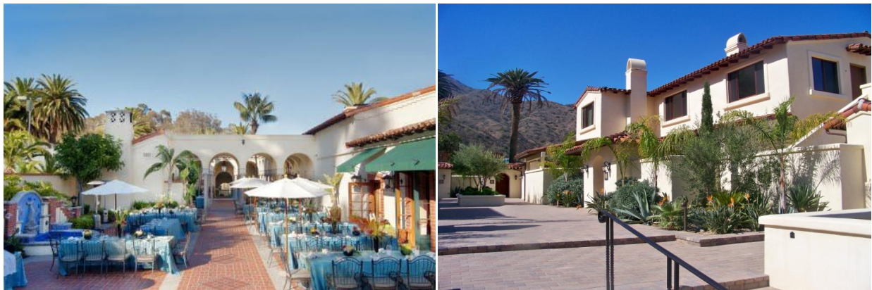
(left) Catalina Island Country Club; (right) Triana of Avalon – affordable housing