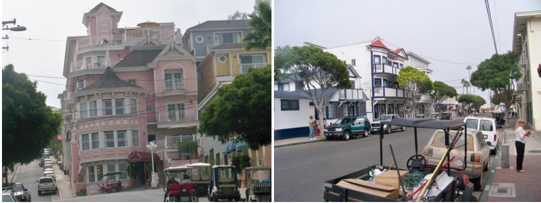
(left) Unique architectural styling; (right) Avalon business district

Finally, on the trip back to the Convention Center there will be a trivia contest based on a combination of learning experiences and just plain fun! Prizes will be awarded – and all attendees are guaranteed to win a memento of their experience on the island.