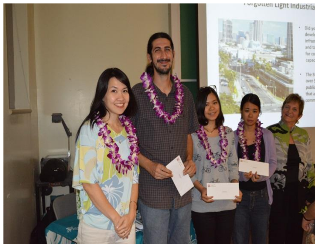
APA Student Scholarship awards